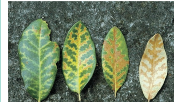
Figure 2. – Live oak leaves showing oak wilt symptom known as veinal necrosis.

Oak wilt diagnoses may be confirmed by isolating the fungus from diseased tissues in the laboratory. Samples can be submitted to: Texas Plant Disease Diagnostic Laboratory, 1500 Research Parkway, Suite A130, Texas A&M University Research Park, College Station, TX 77845. A county extension agent, Texas Forest Service forester, or trained arborist should be consulted for proper collection and submission of samples.